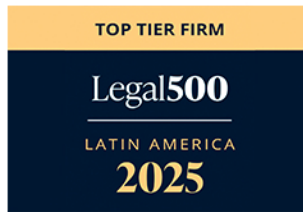
The Legal 500 Top Tier 2025

Pardini & Asociados is a Panama multi-disciplinary law firm, where our clients, transactions and awards are our best introduction. With 40+ years of tradition and experience advising foreign clients and corporations of all sizes, we are your best choice for legal solutions. The law firm has received the following awards during the last years: