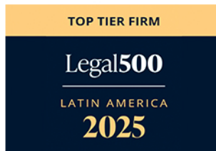
The Legal 500 Top Tier 2025

Pardini & Asociados is a Panama multi-disciplinary law firm, where our clients, transactions and awards are our best introduction. With 40+ years of tradition and experience advising foreign clients and corporations of all sizes, we are your best choice for legal solutions. The law firm has received the following awards during the last years: