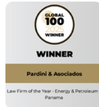
Global 100 Energy & Petroleum 2025