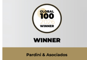
Global 100 Energy & Petroleum 2026