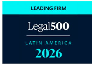
The Legal 500 Leading Firm 2026