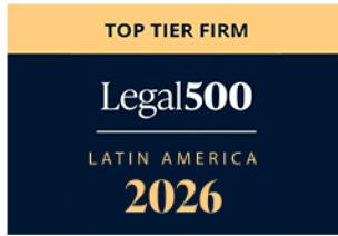
The Legal 500 Top Tier 2026

Pardini & Asociados is a Panama multi-disciplinary law firm, where our clients, transactions and awards are our best introduction. With 40+ years of tradition and experience advising foreign clients and corporations of all sizes, we are your best choice for legal solutions. The law firm has received the following awards during the last years: