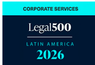
The Legal 500 Corporate Services 2026